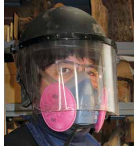
My riot helmet and half-mask respirator