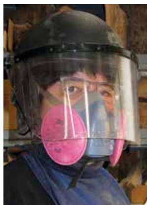
My riot helmet and half-mask respirator