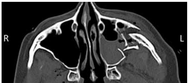
CT scans of my face right after the accident. Compare the left and right sides to see the bone damage and swollen soft tissue.