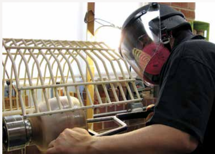
Turning with the wire guard in place, wearing my riot helmet and respirator. The piece, which has multiple cracks, is wrapped in plastic stretch wrap for reinforcement.

As I finished hollowing, I turned up the speed to 1200 rpm to make a few cleanup passes. This speed did not feel unsafe. There was no vibration, and I was