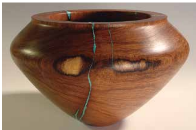
The vessel that broke apart while turning, finished. The segment that hit me is to the left, delineated by the turquoise.