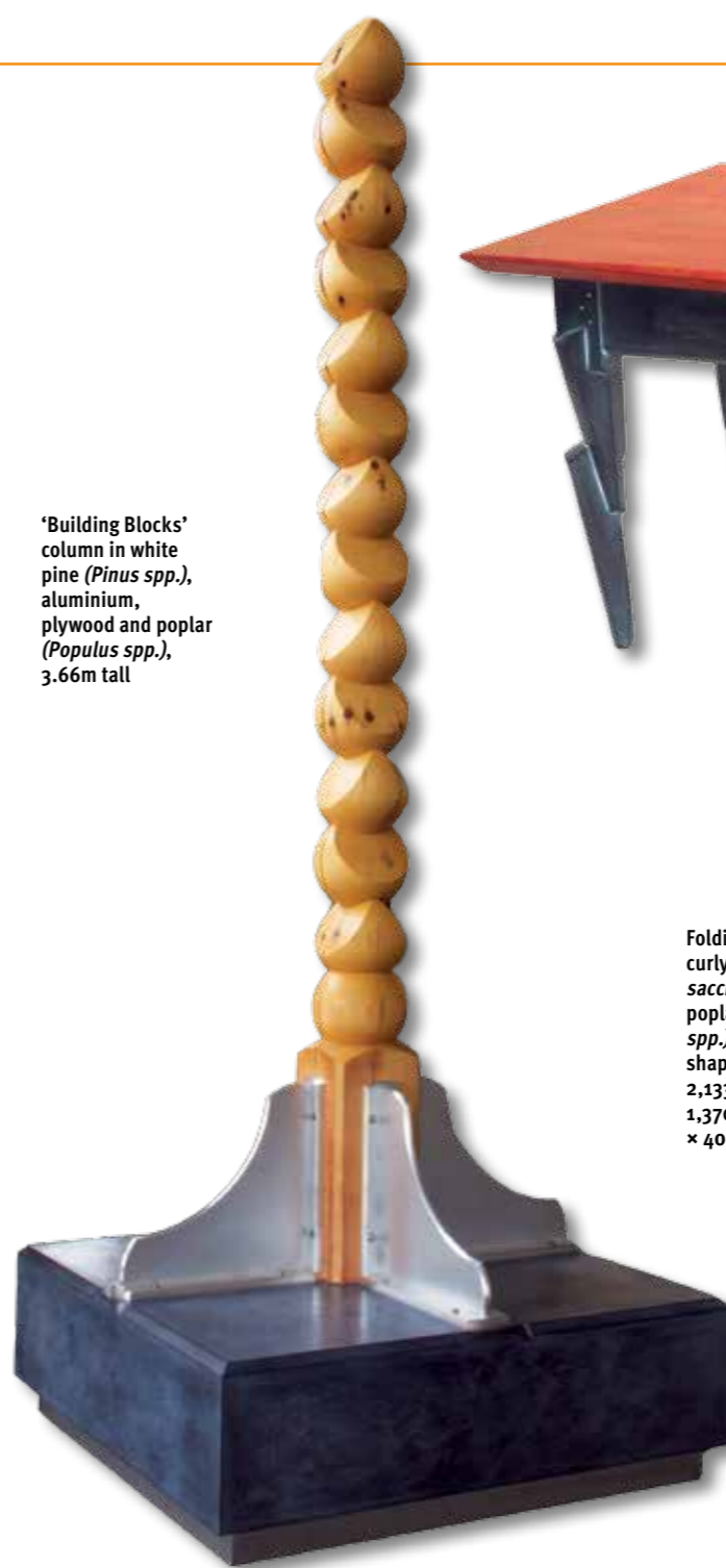
'Building Blocks' column in white pine ( Pinus spp. ), aluminium, plywood and poplar ( Populus spp. ), 3.66m tall

traditional joinery and doing a lot of carving. This was also where he first tried woodturning. "On a whim I tried doing some turning – just simple small plates. I was pleased with the speed of making but really wanted to get away from the predictable roundness that resulted." So he started making experimental turnings and a few years later, he began to incorporate these turnings into furniture. "Most of that early work was faceplate turning, I even did some multi-axis faceplate turnings in 1976. I did some spindle work in 1978 but that has become the focus of my turning for most of my career.