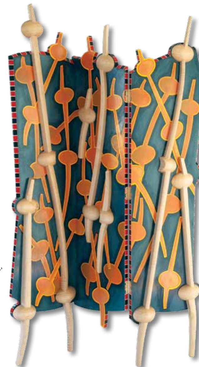
Folding screen in curly maple ( Acer saccharum ) and poplar ( Populus spp. ) with hand-shaped columns, 2,133mm tall × 1,370mm wide × 405mm deep

My serious investigations into multi-axis turning started in 1992," he says.