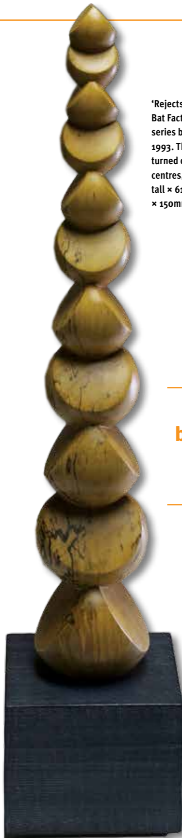
‘Continuous Column’, single axis turning in poplar ( Populus spp. ) and ash ( Fraxinus excelsior ). It was hand carved after turning, 635mm tall × 140mm × 140mm