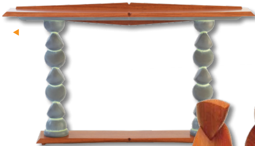
A variation of an inside out turning in oak ( Quercus robur ) and poplar ( Populus spp. ), 510mm tall x 305mm wide x 150mm deep