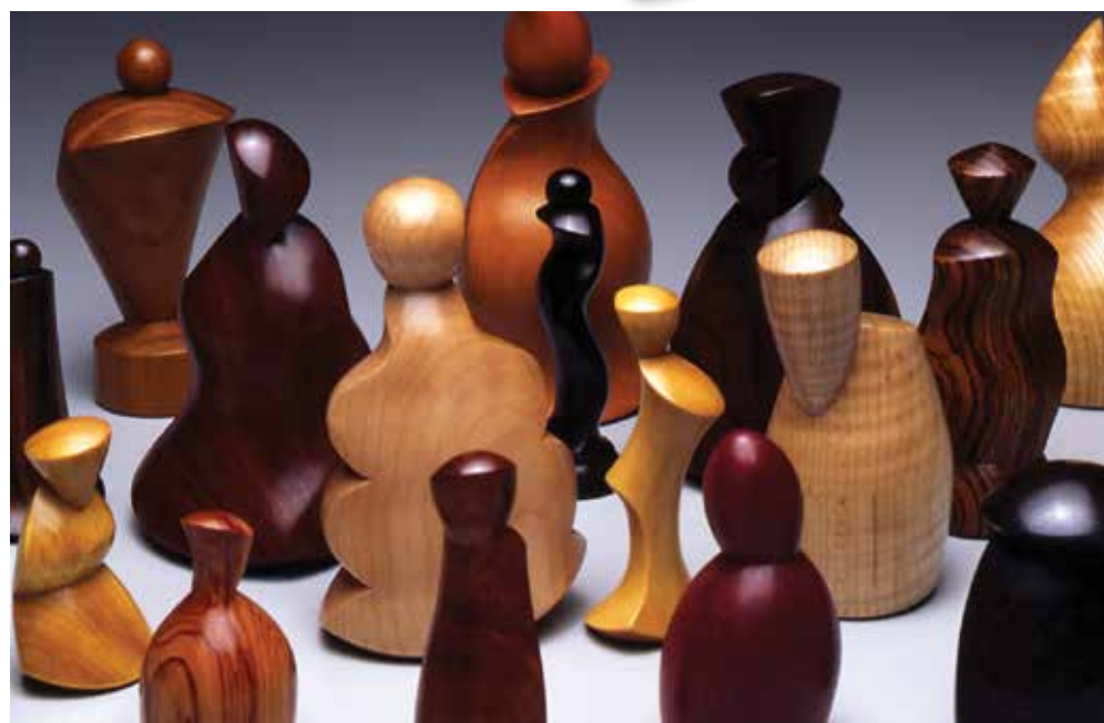
‘Little People’, multi-axis turned figures, variety of sizes: largest is 185mm tall x 100mm wide x 85mm dia.