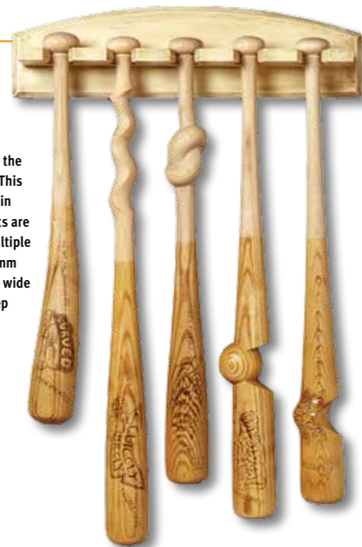
‘Rejects from the Bat Factory’. This series began in 1993. The bats are turned on multiple centres, 965mm tall × 610mm wide × 150mm deep

“Throwing a pot in clay and blowing glass have some similarities to turning but the materials and results are so different”