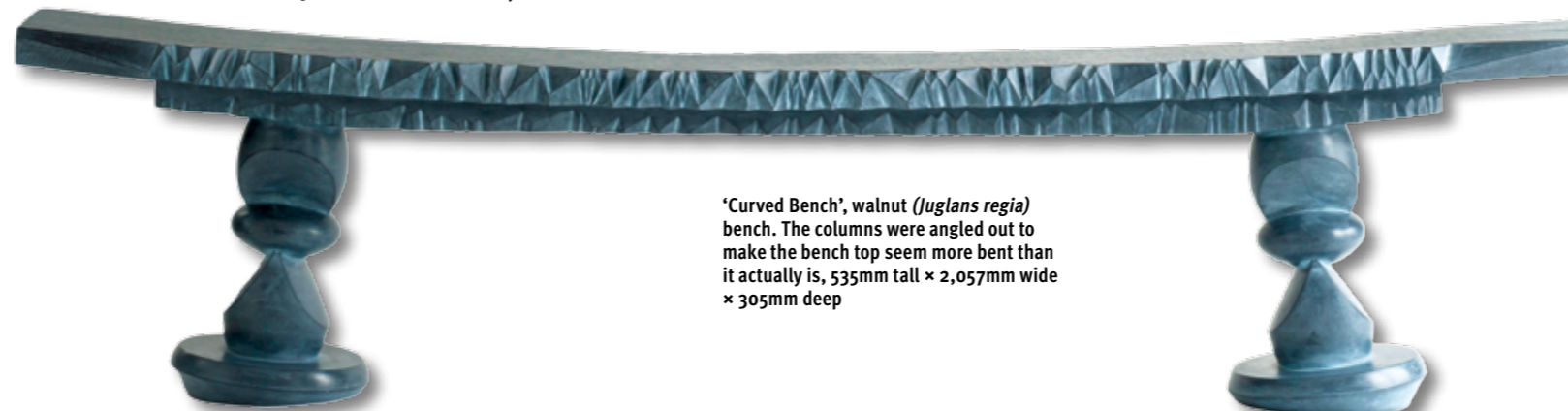
‘Curved Bench’, walnut ( Juglans regia ) bench. The columns were angled out to make the bench top seem more bent than it actually is, 535mm tall × 2,057mm wide × 305mm deep

no such thing as a typical piece either – a piece can take anything from an hour or two to several hundred hours to complete.