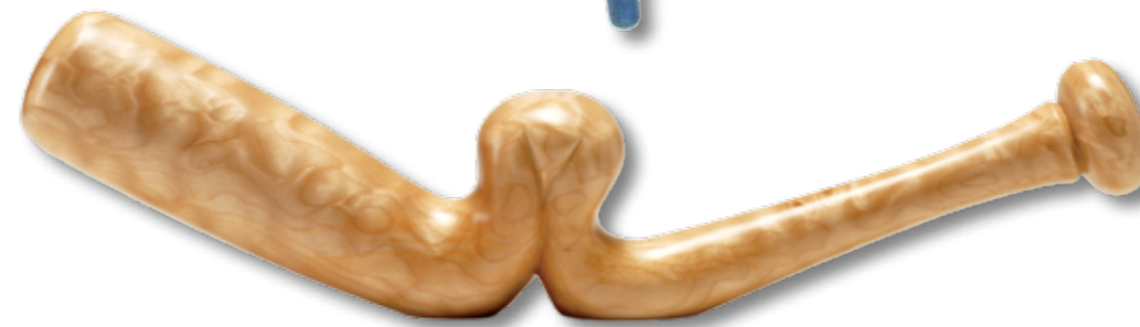
Bat in quilted maple ( Acer saccharum ) turned on two sets of centres with no special jigs or chucks, 150 × 535 × 75mm