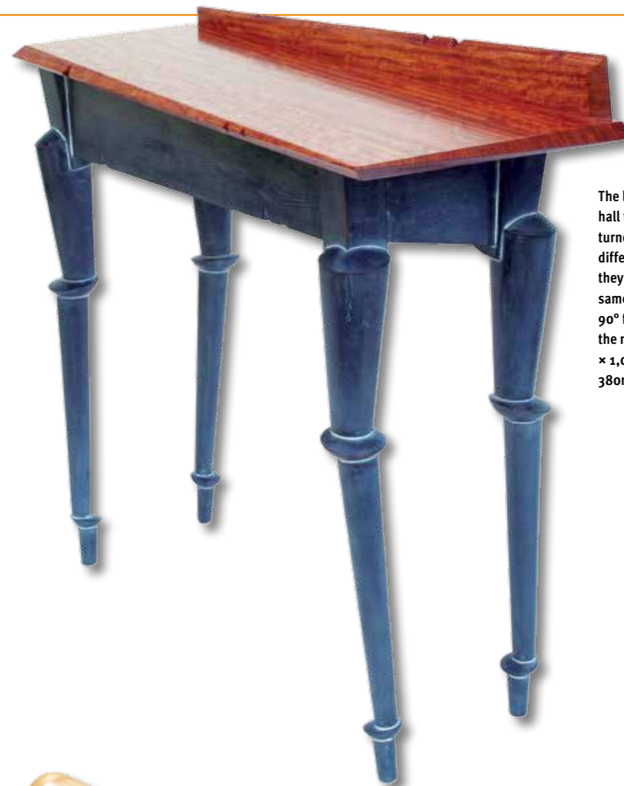
The legs on this hall table were turned on three different axes but they are all the same, just rotated 90° from one to the next, 915mm tall × 1,040mm wide × 380mm deep