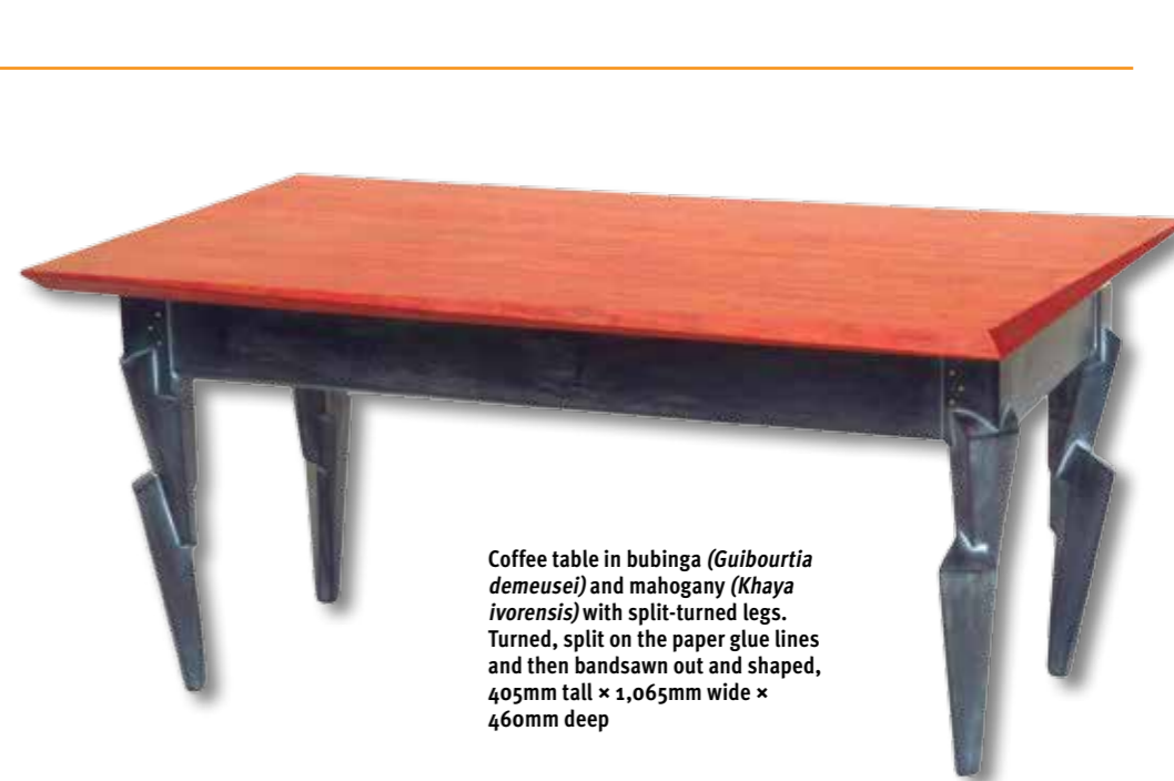
Coffee table in bubinga ( Guibourtia demeusei ) and mahogany ( Khaya ivorensis ) with split-turned legs. Turned, split on the paper glue lines and then bandsawn out and shaped, 405mm tall × 1,065mm wide × 460mm deep

traditional joinery and doing a lot of carving. This was also where he first tried woodturning. "On a whim I tried doing some turning – just simple small plates. I was pleased with the speed of making but really wanted to get away from the predictable roundness that resulted." So he started making experimental turnings and a few years later, he began to incorporate these turnings into furniture. "Most of that early work was faceplate turning, I even did some multi-axis faceplate turnings in 1976. I did some spindle work in 1978 but that has become the focus of my turning for most of my career.