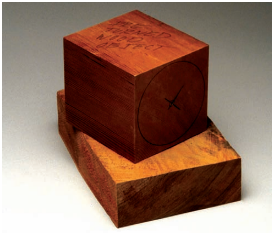
Pre Turned Wood Object, 2000, Collection of the Wood Turning Center