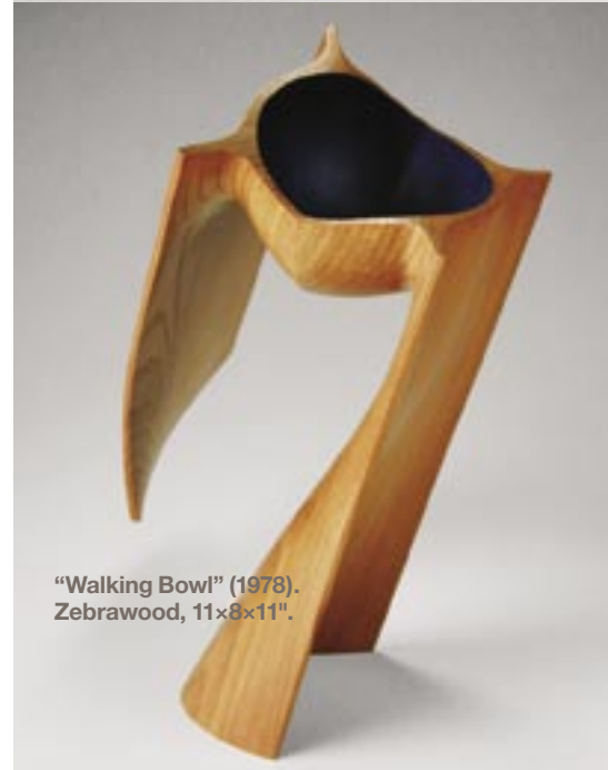
"Walking Bowl" (1978). Zebrawood, 11×8×11".