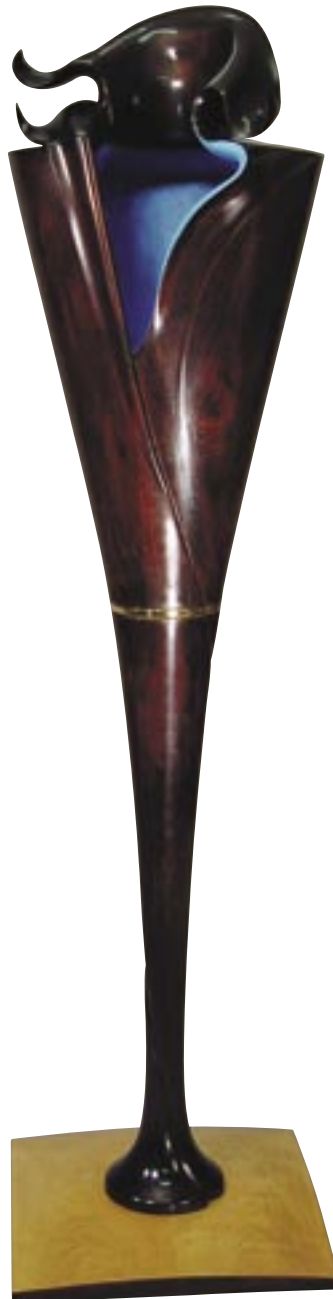
“Cammy-Oh-9-Highlights From the Muse” (2002). Walnut, blue interior; 16×63½”.