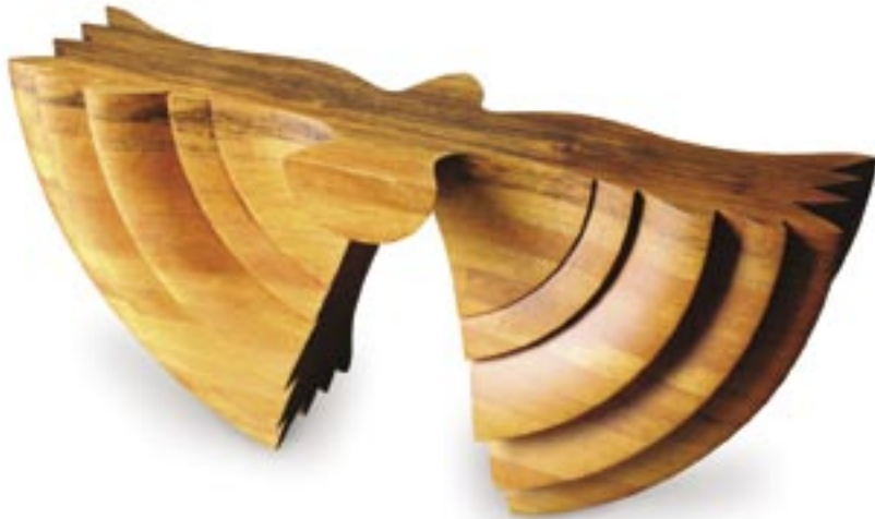
"Bird Table" (1976). Yellow walnut; 30½×10⅝".