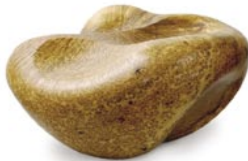
"Tranquil Form #1" (2005). Black ash burl; 8½x18½x16".