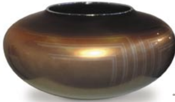
“Sunset Piece” (1987). Lacquered wood; 24" diameter.