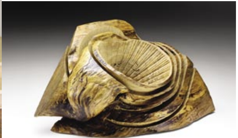
"Chambered Captive" (1992). Spalted yellow birch burl; 14¼x30x15".