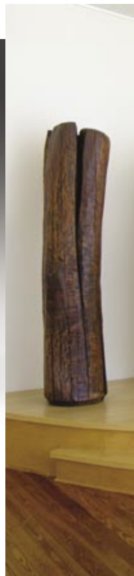
"Analog #1" (1993). Spalted pecan; 30½×38½×19½".