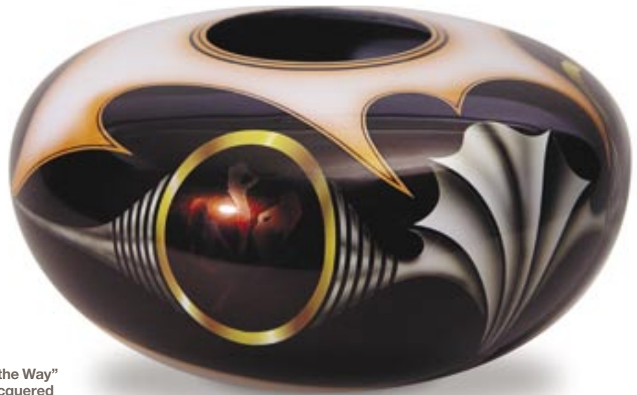
“Figurines in Color and Light” (2006). Lacquered basswood; 7½x13".

more specifically automotive lacquers. It began in the mid-1970s when he recognized that the colors in the woods he had been using—particularly padauk and purpleheart—were unstable. The answer, of course, was to use paint. And with his background interests including fast airplanes, fast cars, and hot licks on his clarinet, it was a natural fit. The only problem was that traditional woodworkers of the time didn't appreciate someone “covering the beauty of the wood.”