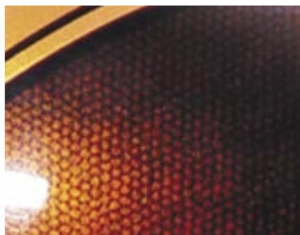
Detail from “Figurines in Color and Light.”

What they hadn't considered was that a new definition of the term beauty was emerging, and that Giles' approach was simply a new way of looking at objects that