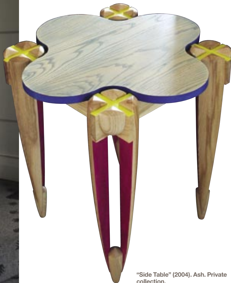
“Side Table” (2004). Ash. Private collection.