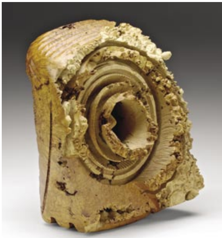
"Rockin' Magnum Sawtooth Opus #1" (1997-2000). Maple burl; 15½×13½×9".