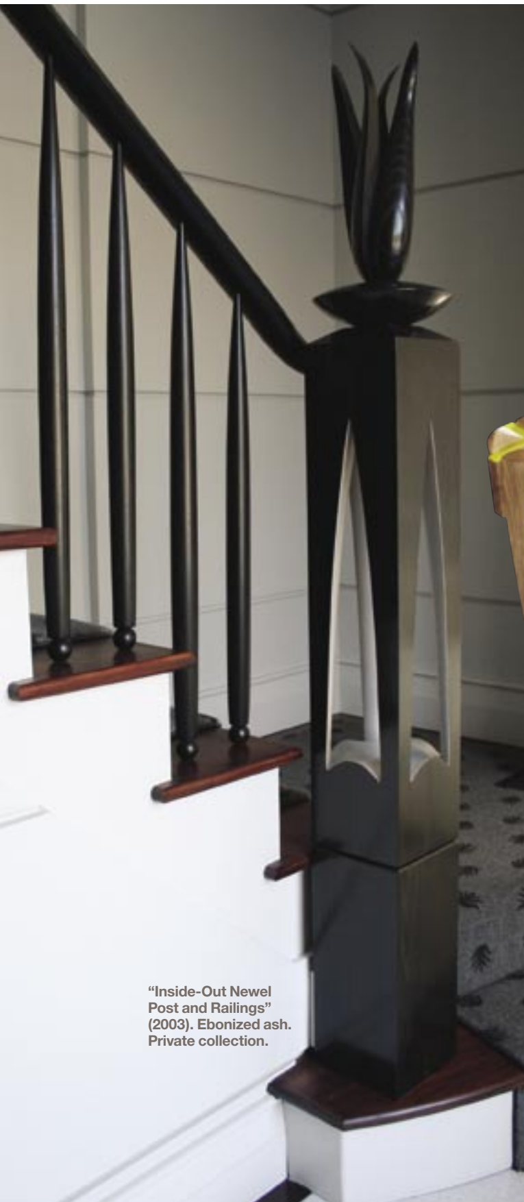
“Inside-Out Newel Post and Railings” (2003). Ebonized ash. Private collection.