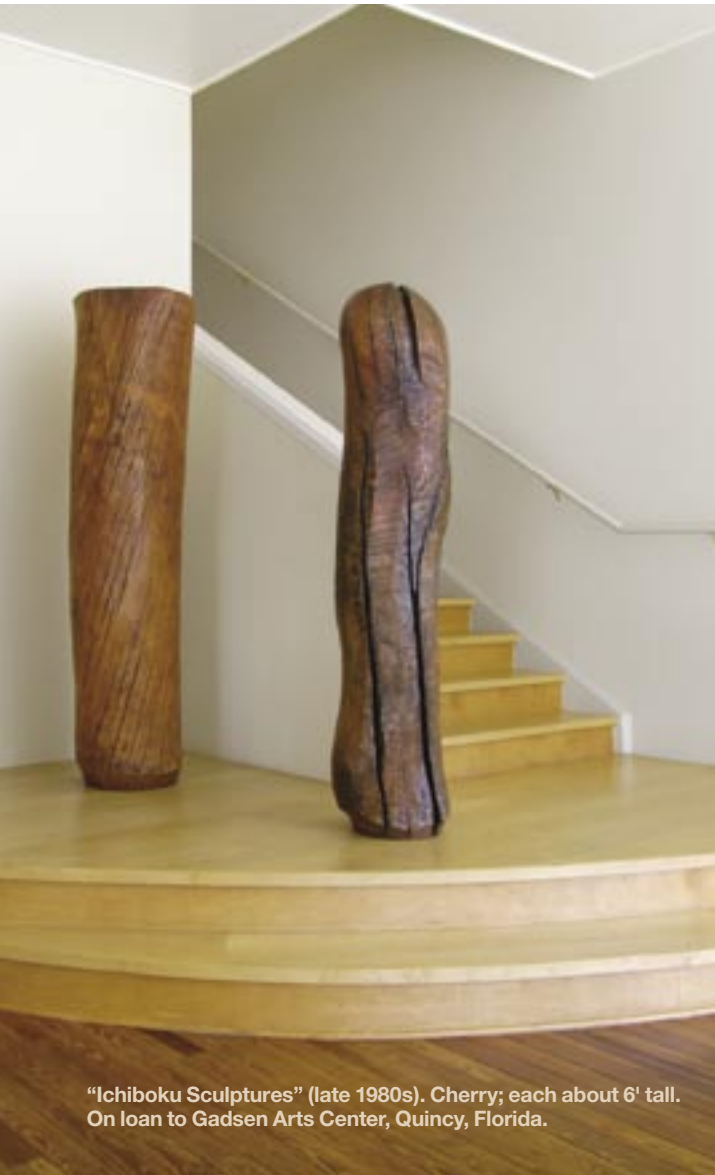
"Ichiboku Sculptures" (late 1980s). Cherry; each about 6' tall. On loan to Gadsen Arts Center, Quincy, Florida.