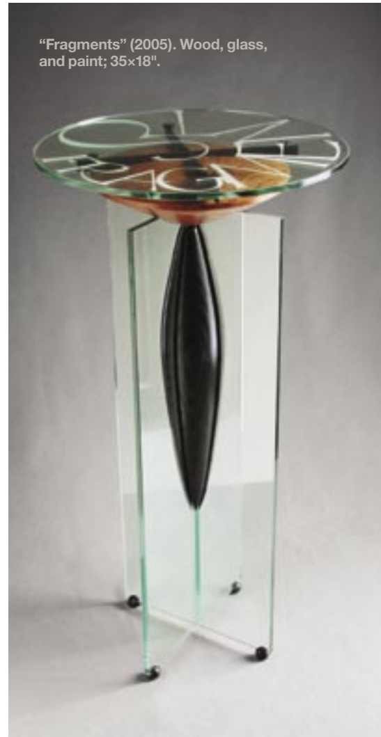
"Fragments" (2005). Wood, glass, and paint; 35×18".