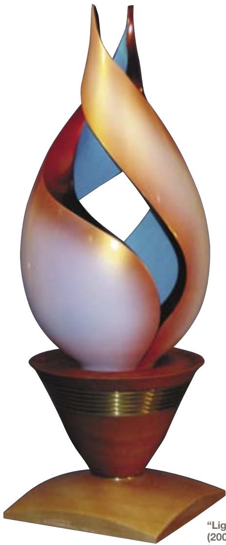
“Lighting the Way” (2001). Lacquered basswood; approximately 30" tall.