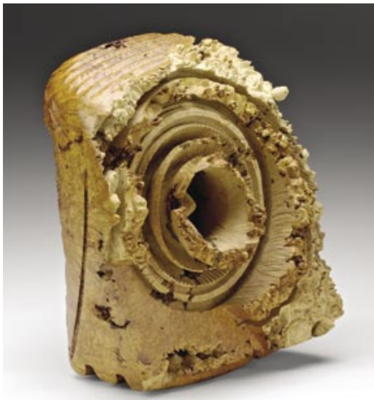
"Rockin' Magnum Sawtooth Opus #1" (1997-2000). Maple burl; 15½×13½×9".